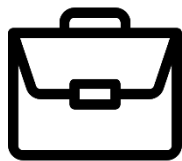
Work and Local Economy