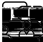
Influence and Sense of Control